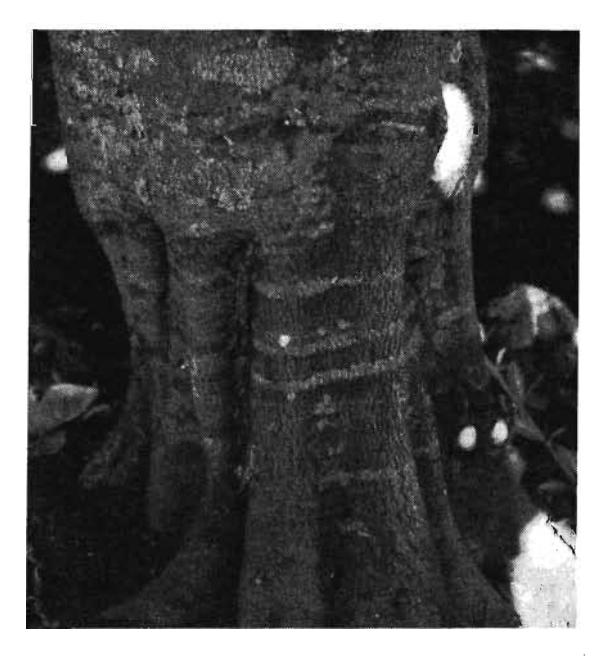
Figure 3. A strong, disease-resistant graft union of Chun pummelo grafted on Heen Naran rootstock.