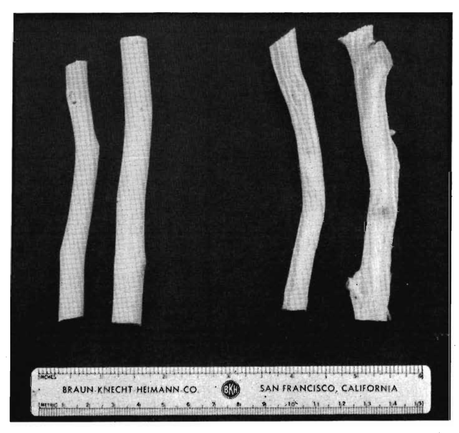
Figure 2. Kusaie lime branches with bark removed. Left, from a disease-free tree. Right, from a tree affected by tristeza. Note pitted furrows in wood.