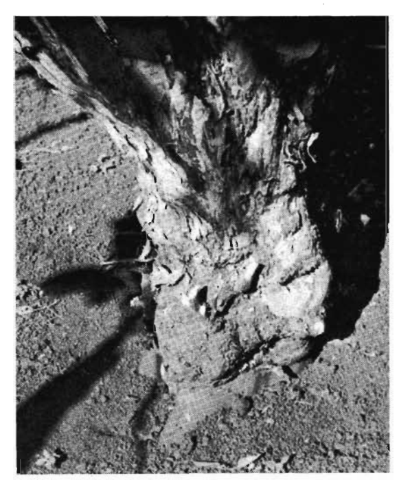
Figure 1. Advanced stage of gummosis on sweet orange.