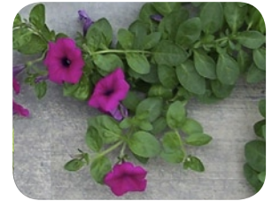
50/50 Potting Soil and Turface® Porous Ceramic Soil Conditioner