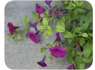
100% Potting Soil

And because Turface lasts year after year, you don't have to keep reapplying it as you do with peat and other organic substitutes.