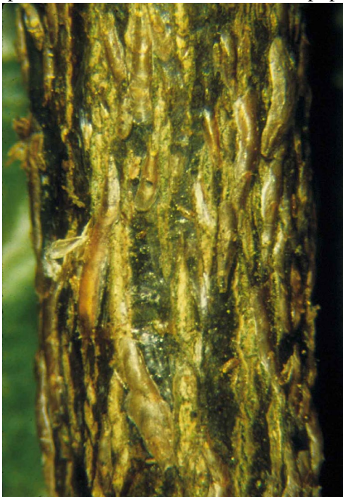
Figure 3. Glover scales on bark.

Glover scale is sometimes referred to as long scale. The scale covering is brown, elongated, narrow in width and about 3 mm in length (Fig. 2). The glover scale is similar to the purple scale and can be found in mixed populations.