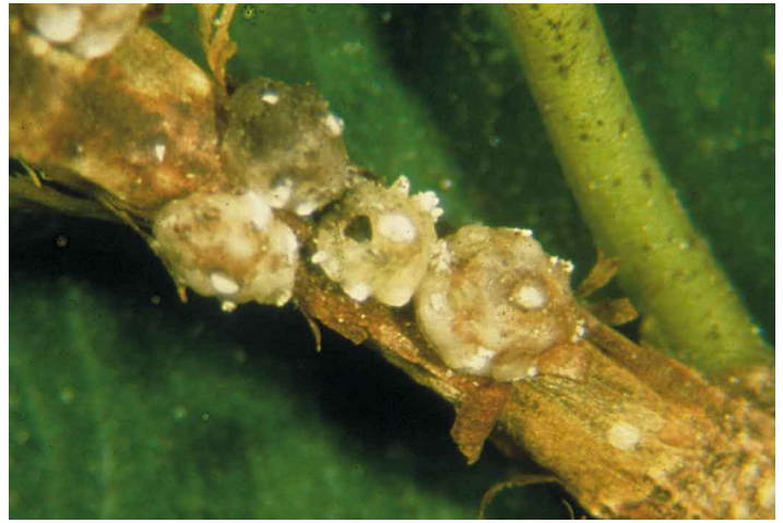
Figure 12. Florida wax scale.

These are not the only scale insects species, as there are more than 40 species of scale insects present on Florida citrus. However, these are the most commonly encountered. For more information on scales, you may wish to consult the following publications: Division of Plant Industry "Arthropods of Florida," University of Florida's SP176 "Identification of Mites, Insects, Diseases, Nutrition Symptoms and Disorders on Citrus," SP43 "Florida Citrus Pest Management Guide," "Integrated Pest Management Guide," and Florida Science Source's "Florida Citrus Pest Diagnostic Guide."