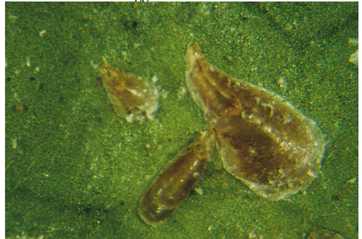
Figure 1. Purple scale.

The armor of the adult female scale is 2 to 3 mm long, purple to dark brown, elongated, and usually curved (Fig. 1). The armor of the male is much shorter and more slender than the female. The eggs are found under the scale cover