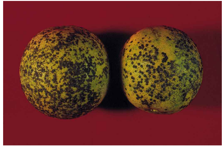
Figure 7. Florida red scale on fruit.