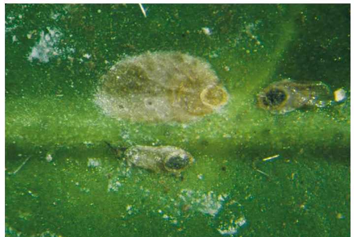
Figure 8. Chaff scale.

The scale covering is irregularly rounded to oblong, 1 to 1.75 mm in length, and very flat (Fig. 8). It conforms to the shape of the area where it begins development and will develop successive layers resembling grain chaff. The color is brownish to grayish. The female body, eggs, and crawlers are purple in color. Immature and male scales resemble the female but are smaller in size. Chaff scale is found on bark, leaves, and fruit. When fruit is infested, the areas around the scale remains green at maturity. Chaff scale can also be found under the calyx of the fruit. When found on the leaves, the midrib is a favored site for settling. Chaff scales are difficult to remove from the fruit surface in normal packinghouse operations. Effective biological control is provided by the parasitic wasp, Aphytis hispanicus (Mercet).