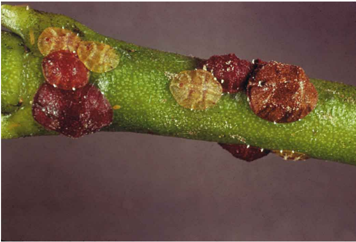
Figure 9. Caribbean black scale (various stages).

The female is 3 to 5 mm long and brown to black in color. When mature it has a very tough shell which is nearly circular or hemispherical in shape (Fig. 9). Ridges along the outer scale body form an “H” pattern. Immature scales have a lighter scale covering and lack the “H” in the early instars. Adult males are free flying. Crawlers are about 0.34 mm long and are light brown. Scales are found on young fruit stems and twigs. Caribbean black scales secrete prolific amounts of honeydew onto the stems and fruit, which later develops sooty mold that will lower fruit grade, if not washed off. A wasp, Scutellista cyanea (Motscholsky), is an egg predator that provides acceptable biological control. When inspecting mature scale for parasitism, one will frequently notice a circular emergence hole in the scale covering caused by the wasp.