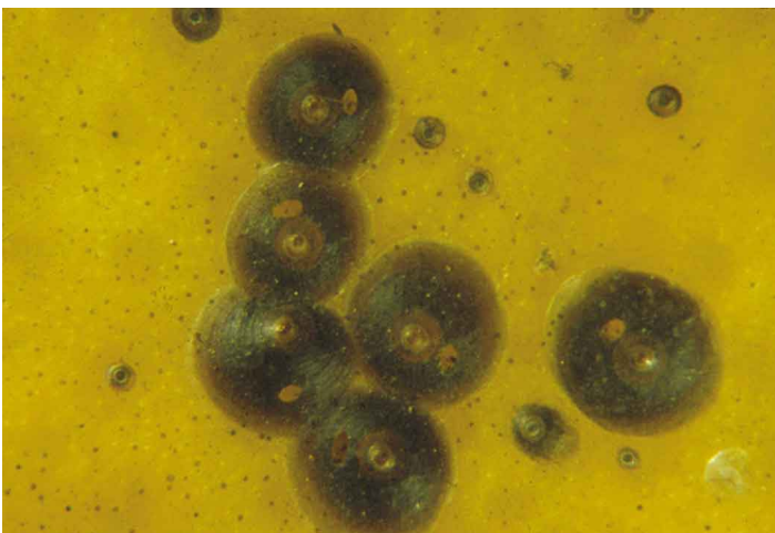
Figure 6. Florida red scale, larger scales contain parasite emergence holes.

Florida red scale is under biological control by the introduced parasite, Aphytis holoxanthus (DeBach). Some additional insect predators feed on Florida red scale.