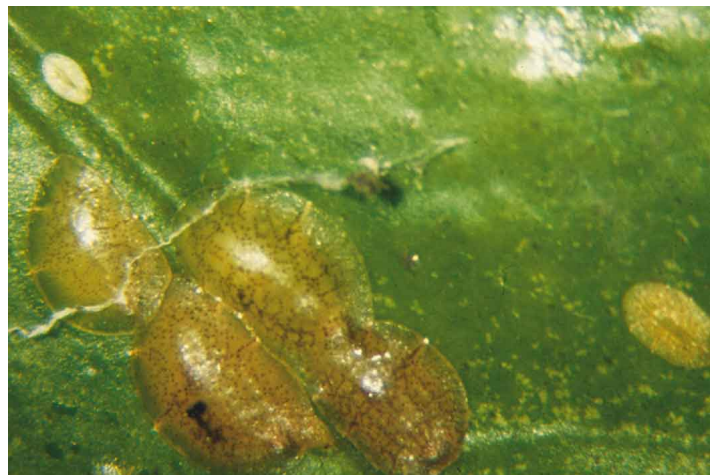
Figure 11. Soft brown scale.

The scale body is flat and oval, light brown to yellowish in color with brown stippling, and 2.5 to 4 mm long (Fig. 11). This scale gives birth to pale yellow crawlers. Males are uncommon. Soft brown scales secrete large amounts of honeydew and the adjoining foliage becomes heavily coated with sooty mold. On occasions young citrus trees can be killed by high populations of soft brown scale from feeding and honeydew production. Scale feeding on older trees results in reduced tree vigor, twig dieback, reduced yields, and lower fruit grades due to heavy sooty mold. Soft brown