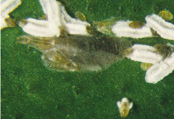
Figure 5. Snow scale, male and females.

Predators commonly found attacking other armored scales have also been found feeding on citrus snow scale. Native and introduced strains of Aphytis lingnanensis Compere and Encarsia spp. are common biological control agents.