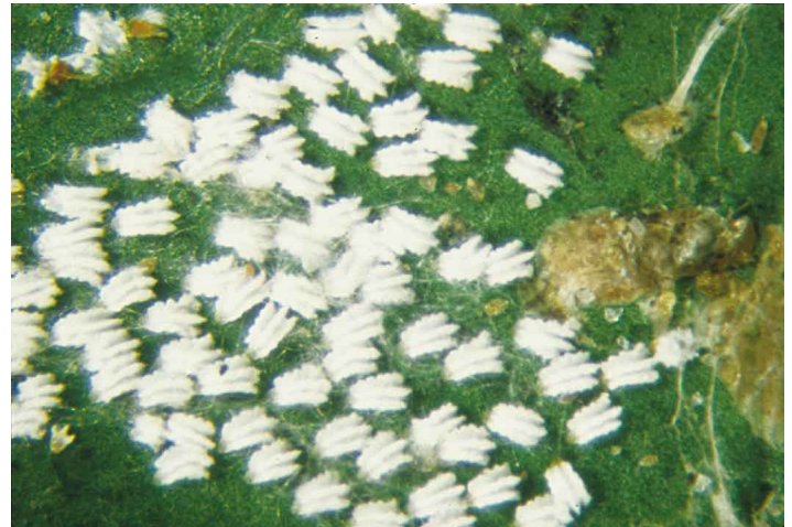
Figure 4. Fern scale.

Scale bodies of the males are white, elongated and about 1.5 to 2.25 mm long whereas the females are brown (Fig. 4). Colonies normally consist of one or two females and up to 30 males. They are found on leaves and fruit of citrus but not on large limbs or trunks. This scale has a wide host range and is found throughout Florida, but never causes economic damage to citrus.