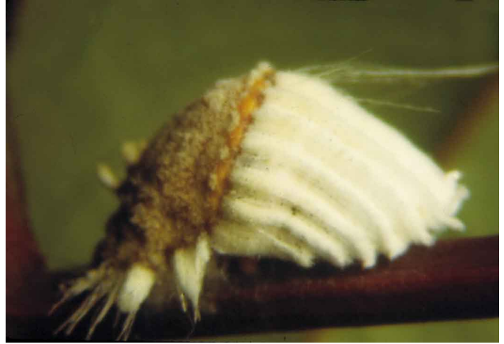
Figure 10. Cottonycushion scale.

Populations are highest in the drier months of fall and winter. The ladybeetle, Rodolia cardinalis (Mulsant), both as larvae and adults, is the main predator of the cottony cushion scale.