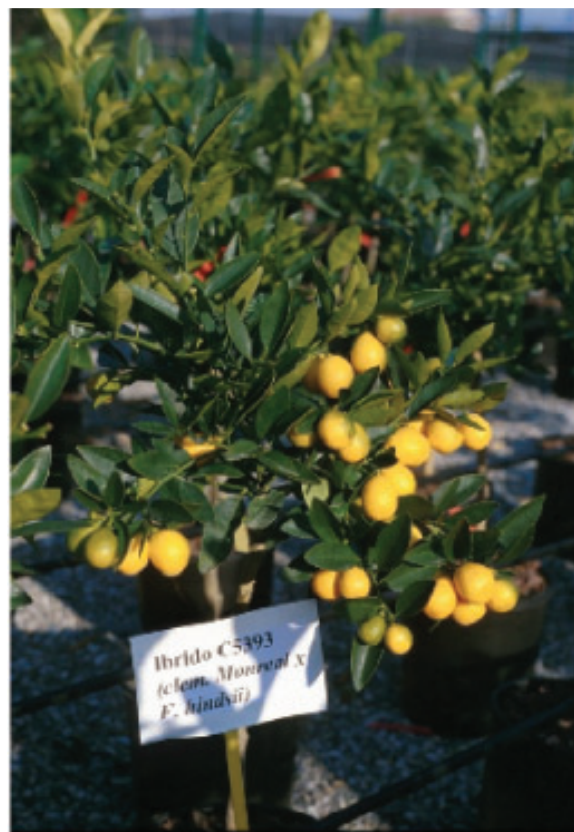
Fig. 1. Nursery tree of 'Reale' ('Monreal' clementine × Fortunella hindsii ).

The tetraploids used are originated by doubling the chromosome number of the nucella (Russo and Torrisi, 1951) or other somatic tissues. This can lead to duplex autotetraploids