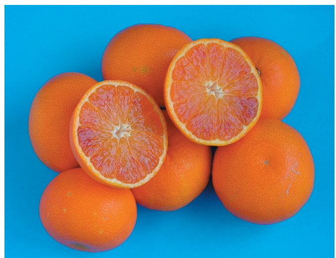
Fig. 3. Fruit of 'Mandared' ('Nules' clementine × 'Tarocco' orange).

where the heterozygote AAaa separates in a 1AA: 4Aa: 1aa ratio, supposing casual separation of chromosomes, so that the recessive homozygote is present in only 16.6% of the microspores. This explains why the triploid progenies we obtained present lower variability than diploids and why many of the triploid hybrid characteristics are more like those of the male tetraploid parents than the female diploid ones.