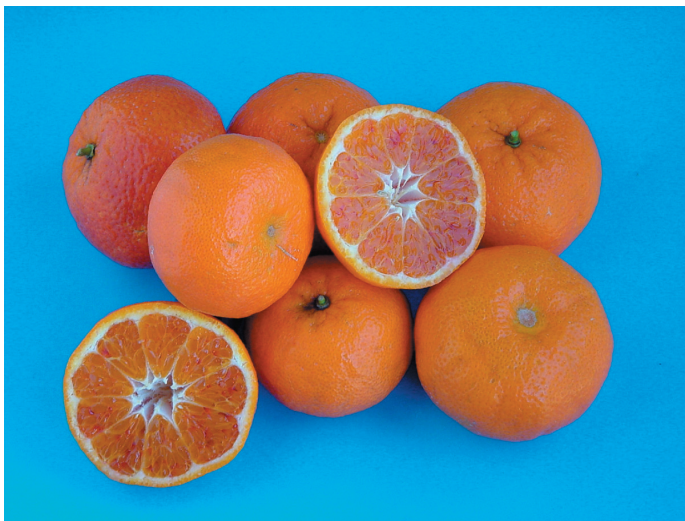
Fig. 2. Fruit of 'Alkantara' ('Oroval' clementine × 'Tarocco' orange).

y I = 29 Nov. 2001; II = 27 Dec. 2001; III = 24 Jan. 2002; IV = 10 Apr. 2002, V = 7 Oct. 1999.