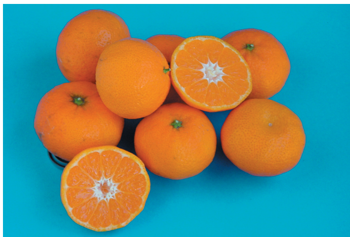
Fig. 4. Fruit of 'Mandalate' ('Fortune' mandarin × 'Avana' mandarin).